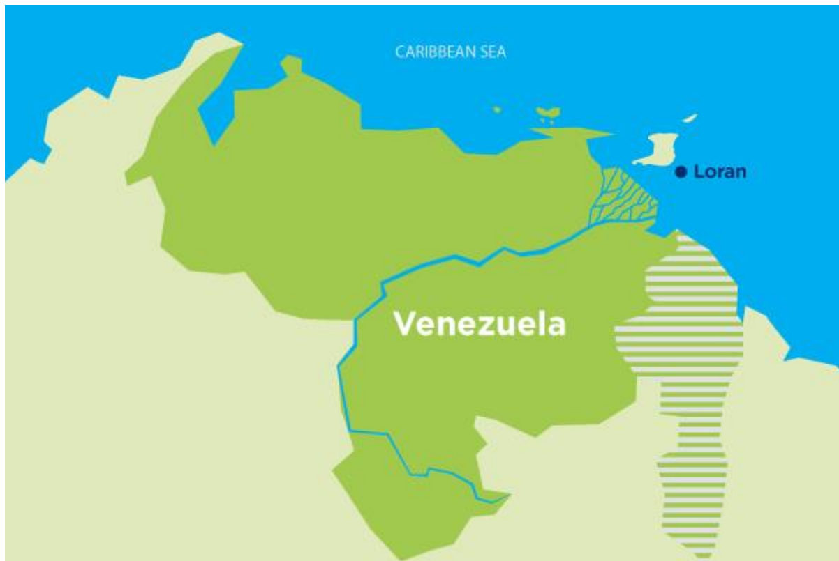
Figure 2. The Loran-Manatee Gas Field.

The Loran-Manatee agreement recognizes two particularly important issues with the development of subsea petroleum rights. First, the extensive research done demonstrates the importance of definitively establishing ownership interests prior to development for each field discovery to prevent future disputes. Second, it demonstrates the role that corporate entities can play in the development of subsea petroleum, establishing and gathering all the information about the different petroleum rights. It is certain that if requested, oil and gas companies can play a very important role in dispute resolution schemes in future disputed territories. By agreement in 2019, Trinidad will now proceed with exploration of its side of the Loran field using Shell Oil Company.